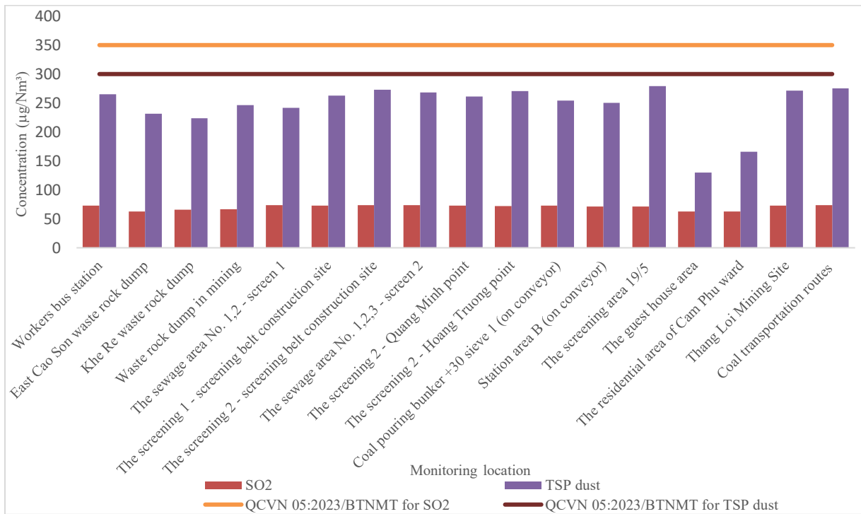
Fig. 2. The monitoring results of SO 2 and TSP dust in the rainy season of 2024 at Coc Sau Coal Joint Stock Company - VINACOMIN (Information, Technology, and Environment Joint Stock Company – Vinacomin, 2024)