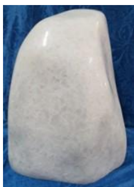
Figure 3 showcases some sample products crafted from the marble in Bac Kan province, demonstrating its potential for use in decorative stonework.

Potential for extraction and use as decorative stones: The exposed marble areas and quarry sites generally have favorable transportation access, allowing vehicles to reach most locations. However, certain sites, such as the Tân Lập marble area, face transportation challenges, requiring consideration of road expansion methods to facilitate transport. Overall, the conditions for extracting marble for use as decorative stone are quite favorable.