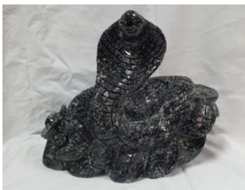
A product of Pia Ma granosyenite (the product's height of 0.30m)