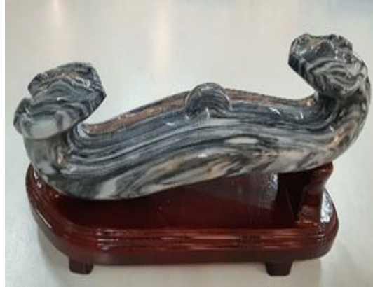
A product of limestones at Ban Tac area (the product's length of 0.30m)