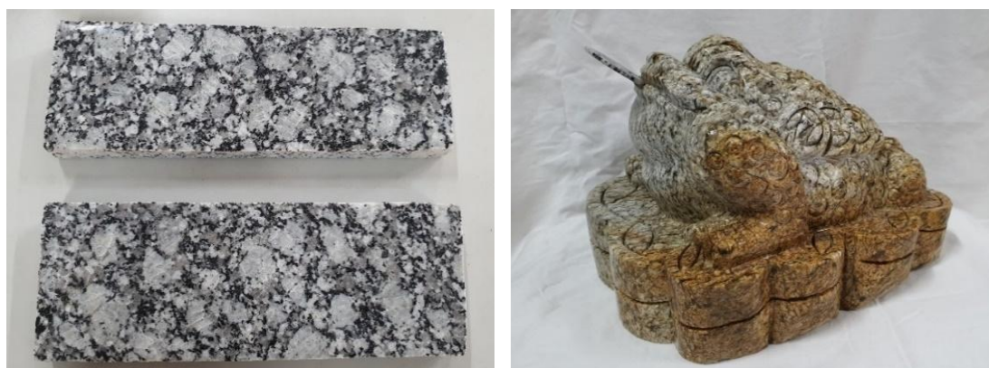
Products of Phja Bioc granite (each product is 0.30m long) A product of Ngan Son granite (the product's height of 0.20m)

Figure 4 introduces sample products crafted from Phja Bioc granite and Ngan Son granite in Bac Kan province, designed for use as decorative stones.