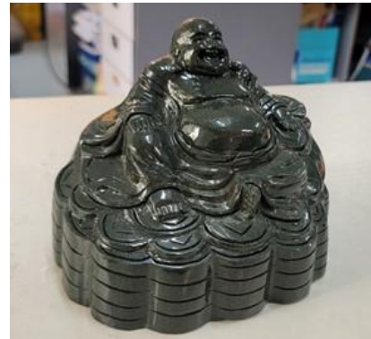
A product of Thuan Mang gabbro (the product's height of 0.20m)