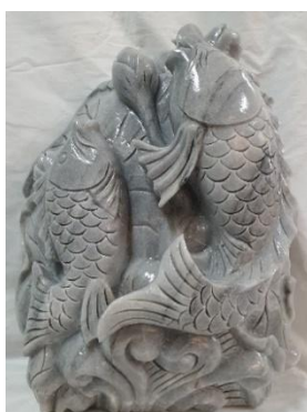
A product of marble at Ngoc Phai