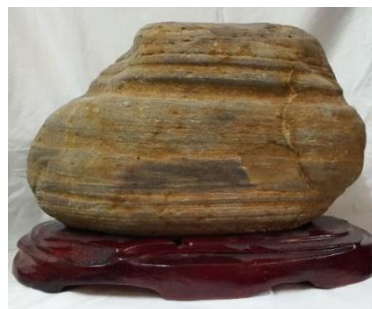
A product of banded sandstone at Bach Thong district (the product's height of 0.25m)