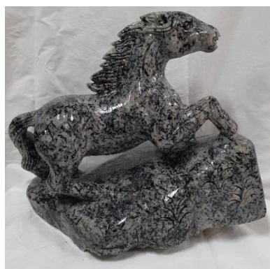
A product of Bang Phuc syenite (the product's height of 0.30m)