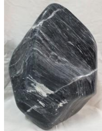
A product of banded limestones at Keo Put area (the product's height of 0.25m)