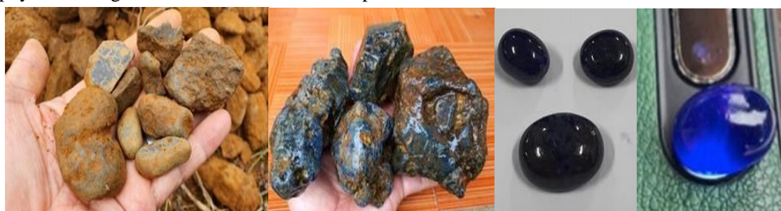
Fig.7. The Hoang Tri sapphire before and after crafting under normal light (left) and in transparency under spotlight (right)

Figure 7 shows raw sapphire from Hoang Tri (placer form) and its experimental crafting. Figure 8 introduces products crafted from banded sandstone from Bacch Thong, quartz from Lang Ngam, and calciphyre from Ngoc Phai for ornamental stone production.