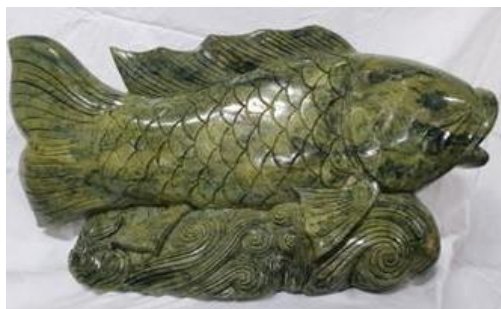
A product of Ngoc Phai calciphyre (The product's length of 0.6m)