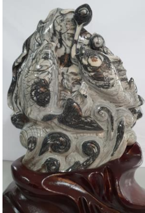
A product of limestones at Pu Mo area (product's height of 0.35m)

Figure 2 shows some decorative products are experimentally crafted from the above limestones in Bac Kan province.