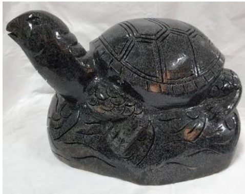
A product of Bang Phuc gabbro (the product's height of 0.30m)

Figure 5 introduces trial products crafted from gabbro found in Bang Phuc and Thuan Mang, used as decorative stones.