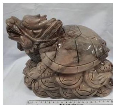
A product of marble at Vu Muon (the product's length of 0.25m)