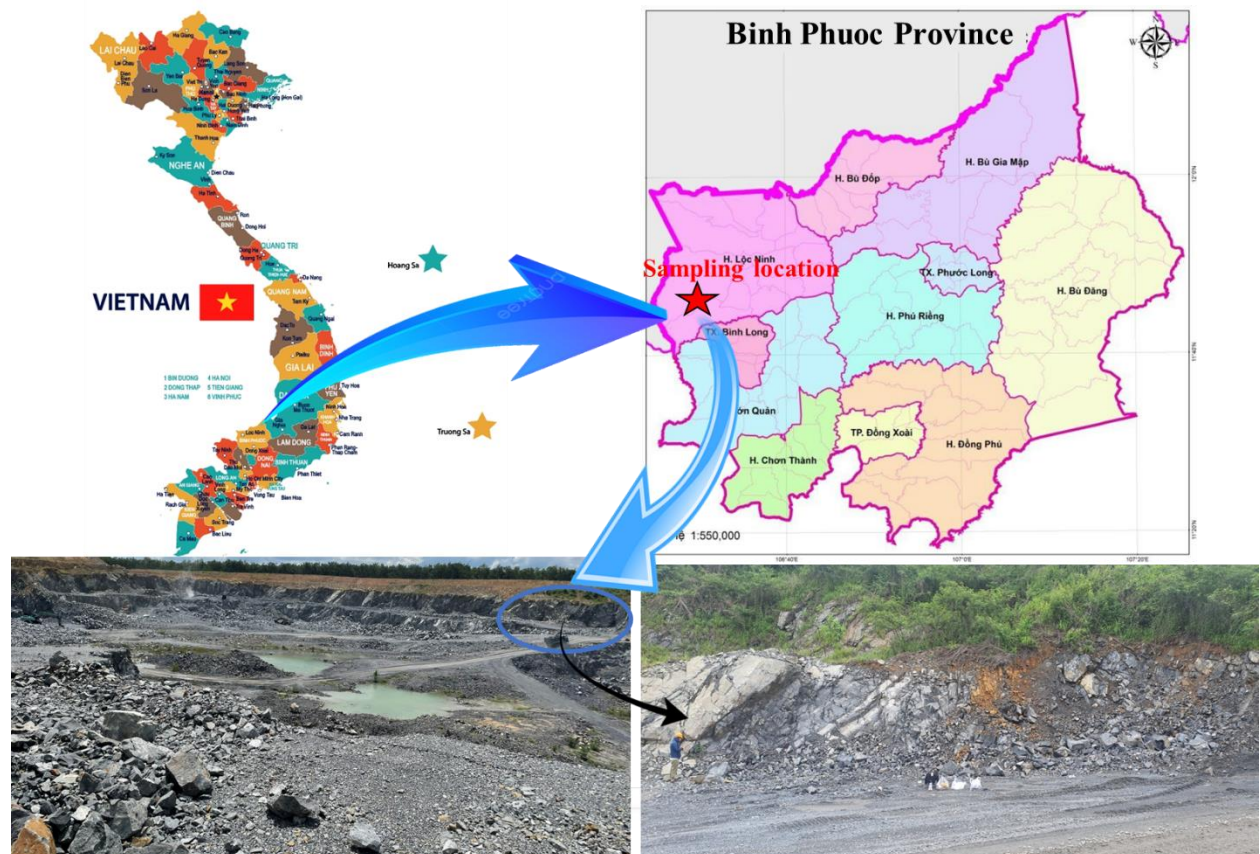
Fig. 1. Sampling area location

(Cronan, 1972; Herron, 1988; Krumbein & Sloss, 1951; Mỹ et al., 1994; Quý et al., 2014; Thanh & Khúc, 2005).