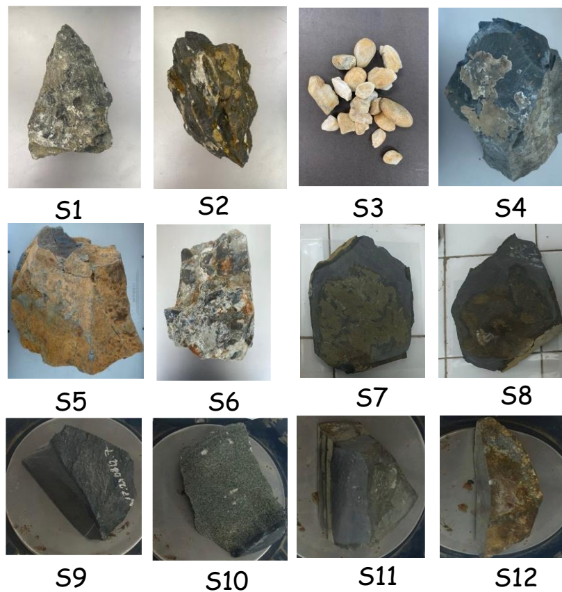
Fig. 2. Some images of 12 sediment samples

A total of 12 sediment samples were systematically collected from different exposed sections of the Viet Phuong 2 quarry. To enhance the understanding of the study's methodologies and findings, Fig. 2 provides visual documentation of the geological samples analyzed. This figure includes images of the sediment samples taken from various sections of the Viet Phuong 2 quarry, along with close-up views of the sedimentary structures and textures.